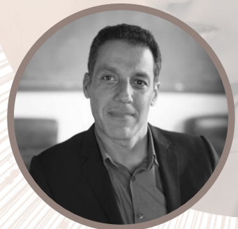
PROFESSOR HANY FARID

Professor Farid received his undergraduate degree in Computer Science and Applied Mathematics from the University of Rochester in 1989, an M.S. in Computer Science from SUNY Albany, and a Ph.D. in Computer Science from the University of Pennsylvania in 1997. He is the recipient of an Alfred P. Sloan Fellowship, a John Simon Guggenheim Fellowship, and am a Fellow of the National Academy of Inventors.